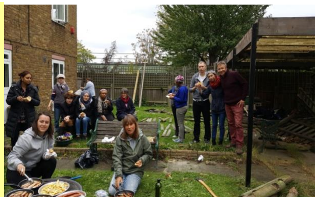
Holmleigh Staff enjoy a well earned lunch cooked outdoors on a half term grounds and garden work day.