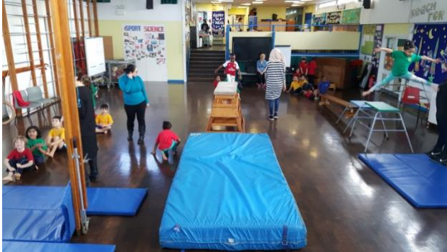
Spectacular work in a Year 1 PE lesson. Ms Esma and Ms Srur

new topic on 'Sculptures' in Art, and will be creating our own sculptures using a range of materials. Please do send in any unwanted scrap/recyclable materials such as cardboard boxes and plastic bottles!